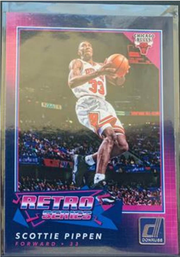
Retro 2017 Card